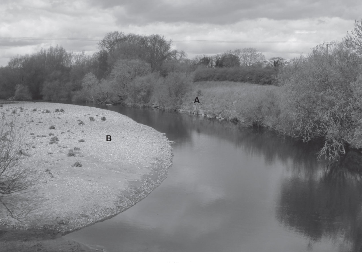
Fig. 1 A meander on the River Swale in North Yorkshire, UK